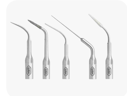
Perfectly coordinated tip range For prophylaxis and periodontology, endodontics, implantology and restoration.