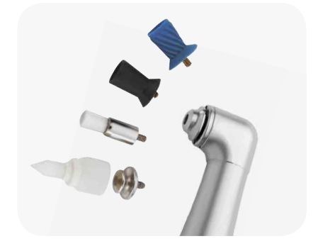
Incredibly adjustable The UNIVERSAL contra-angle handpiece can be used for all standard screw-in caps, brushes and Snap-On adaptors.