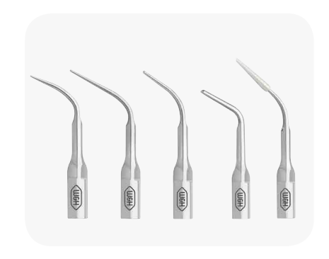
Universal tips and implant clean tip 1U, 2U, 3U, 4U, 1I Implant

Compact, high-quality tip system. 22 universal and special tips, perfectly coordinated for the requirements of the respective application areas and individual treatment steps. All W&H tips can be thermo washer disinfected and sterilized.