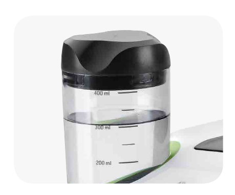
400\,\text{ml} coolant tank

For prophylaxis and periodontology, endodontics, implantology and restoration.