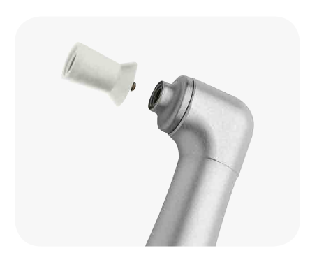
Versatile and flexible YOUNG system — can be used for YOUNG screw-in caps and brushes. The sealing effect is renewed every time the cap is changed, which ensures maximum hygiene.