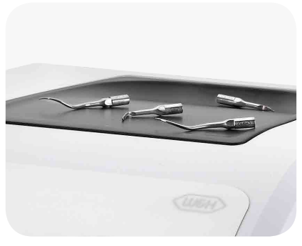
Tray and handpiece holder

Scale with 50 ml intervals so you can mix the rinsing liquids directly in the coolant tank.