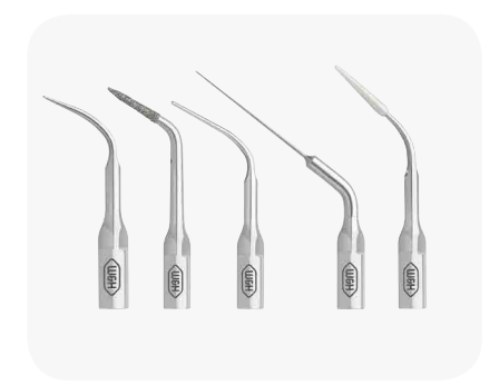
Perfectly coordinated tip range

Perfect lighting conditions and the same visual perception as with daylight.