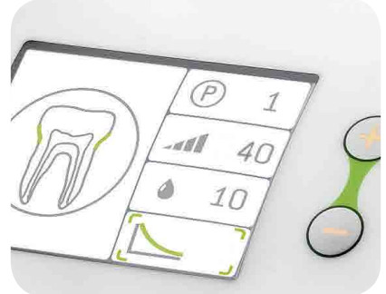
Safe treatment thanks to three preset power modes Power-Basic-Smooth — you can set the scaler power to suit your preferences.