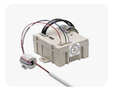
Piezo built-in kit For installation in your existing dental unit.