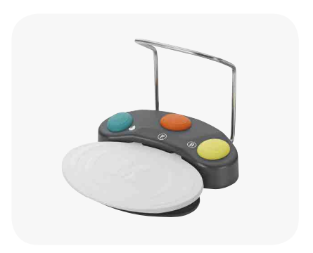
Multifunctional foot control Simple operation so you can concentrate on your patient.