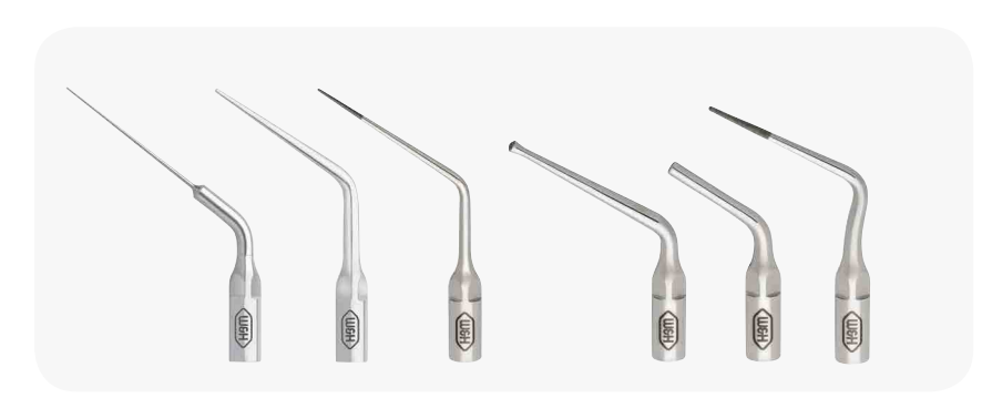
Endo tips 1E, 2E, 3E, 4E, 5E, 6E