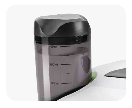
Very gentle thanks to temperaturecontrolled liquid Even sensitive teeth and gums are no longer irritated.

Simple, safe and relaxing. The piezo scaler Tigon+ facilitates your daily work processes considerably and your patient remains completely relaxed during the treatment.