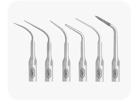
Large tip range Best results in endodontics, prophylaxis, periodontology and micropreparation.