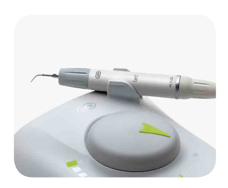
The ergonomic design of the handpiece and its light weight allows you to work for longer without tiring.