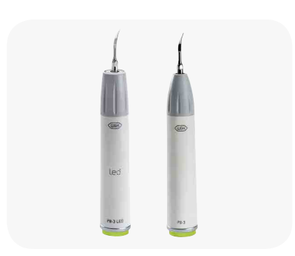
Two versions The Pyon 2 handpiece is available with a 5x Ring LED or without light.