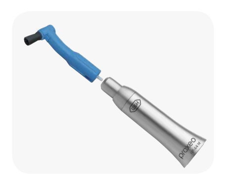
User-friendly and hygiene-friendly The straight handpiece for all disposable contra-angle handpieces with plastic shaft, Doriot system. The complete contra-angle handpiece is removed after use.