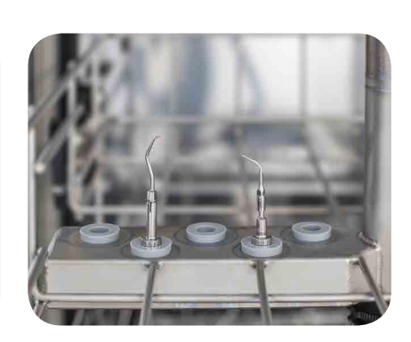
W&H adaptor set

Their smooth surface means that the instruments are easy to clean and can be both thermo washer disinfected and sterilized.