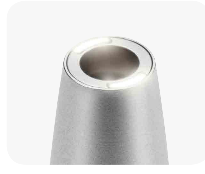
Large optic outlets

The powerful, controlled deployment of the power can be adjusted to suit the application in question using the power regulator.