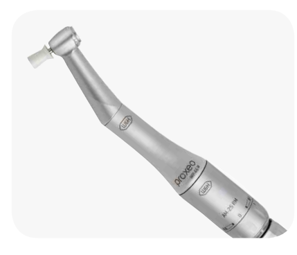
Simply fast The WP-66 M contra-angle handpiece with push-button chucking system is compatible with all cups, brushes and Snap-On adaptors with 2.35 mm shaft.