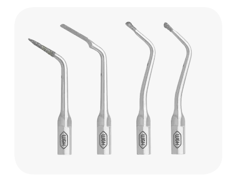
Restoration tips 1R, 2R, 3Rm, 3Rd