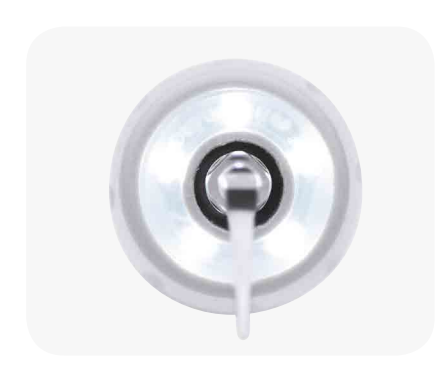
Handpiece with 5x Ring LED for optimal lighting conditions.