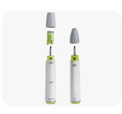
Separable The Pyon 2 handpiece can be taken apart, is easy to clean, can be sterilized and is thermo washer disinfectable.