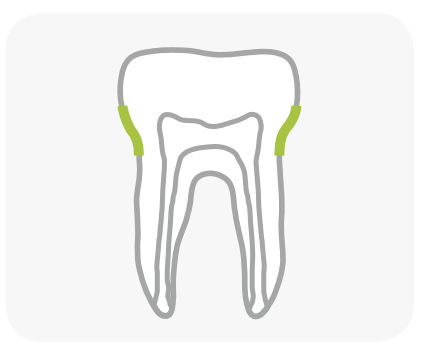
Five different treatment options The navigation tooth on the display shows which of the five programmes you are currently using.