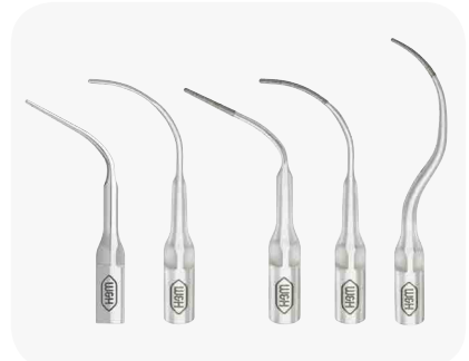
Periodontal tips 1P, 3Pr/3Pl, 4P, 5Pr/5Pl, 5P