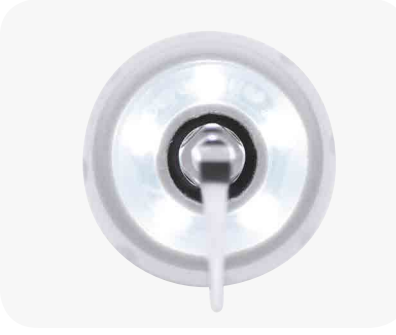
Handpiece with 5x Ring LED

The scaler power and coolant flow rate can be varied using the buttons.