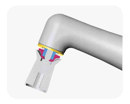
Long life and hygienic Long service life with special sealing system. Prevents penetration of paste or particles resulting from treatment.

Compact and simple. Proxeo, the contra-angle handpiece for cleaning, polishing and fluoridation. The most important advantages: its small head with the special sealing system, which prevents any polishing paste from entering.