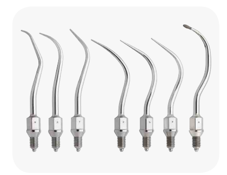
Efficient range of tips

Two large optic outlets provide perfect illumination of the treatment site.