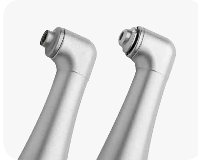
Best view A small contra-angle handpiece head ensures an excellent view of treatment sites — even in the distal region.