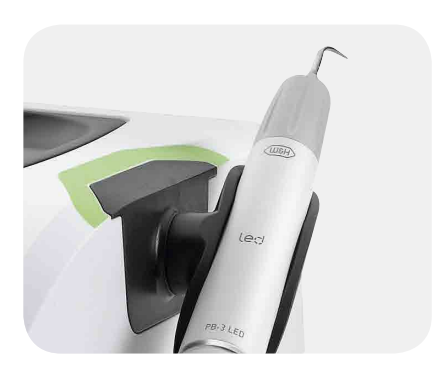
Ergonomically formed handpiece

The tray for your instruments can be thermo washer disinfected and sterilized.